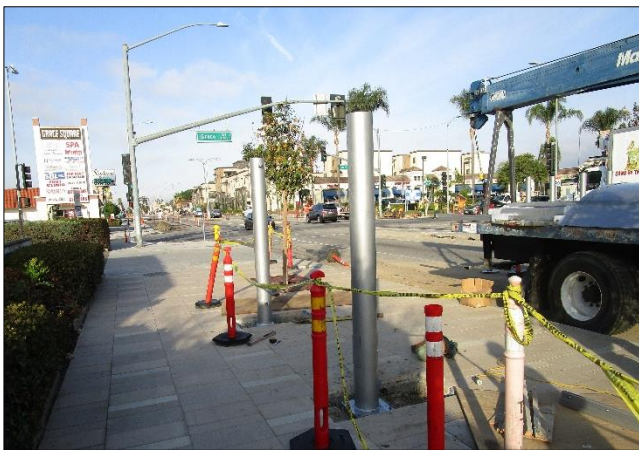
Bus Shelter Supports Installed