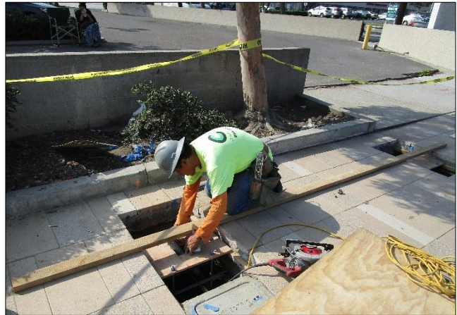
Setting Reinforcing Cage and Anchor Bolts for Transit Shelter