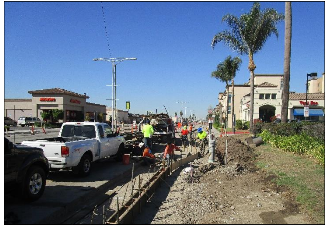
Placing Architectural Pavers on South Side of Carson