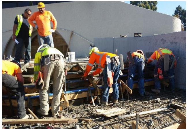
Placing East Stairway City Wall