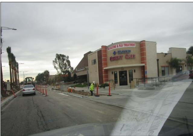
Placing Curb and Gutter on North Side of Carson West of Grace