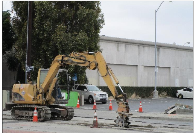
Compacting Recycled Water Trench Backfill on Main St.