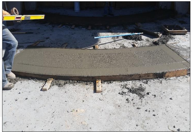
Band at City Hall Replaced ADA Push Button