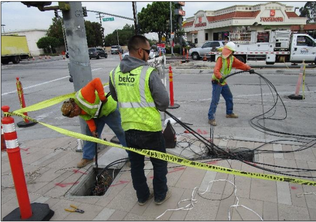
Paving Trench on Westbound Carson East of Main