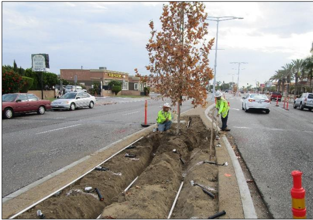
Installing Irrigation Laterals, Risers and Heads in Median