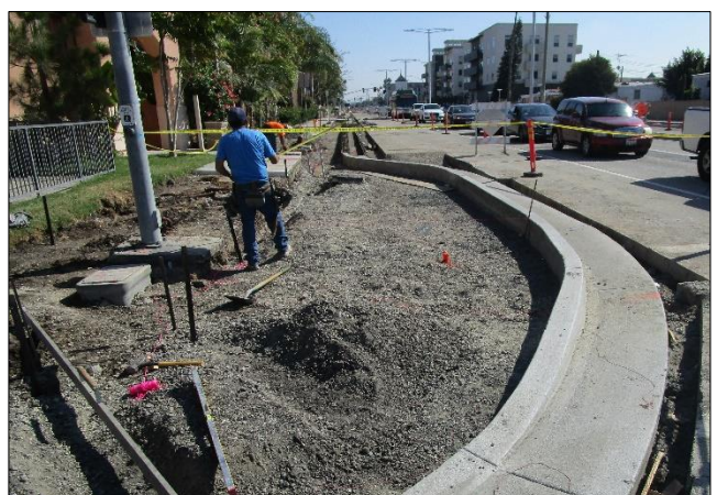
Grading and Forming Handicap Ramp