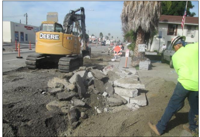
North Side Demolition