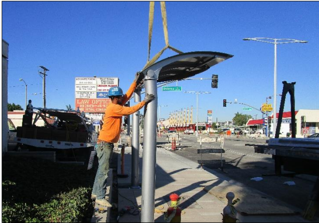
Installing Bus Shelter