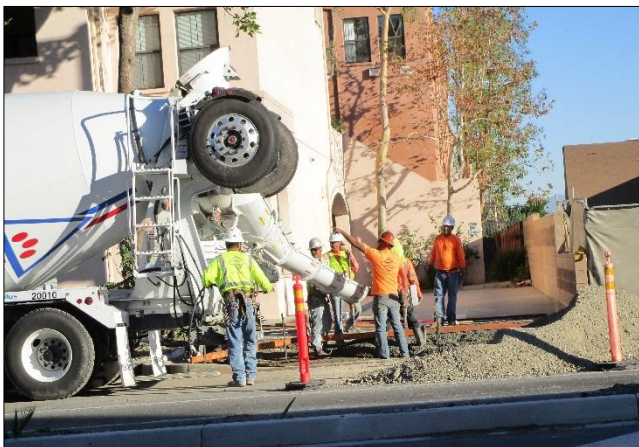
Placing Driveway West of Via Verde