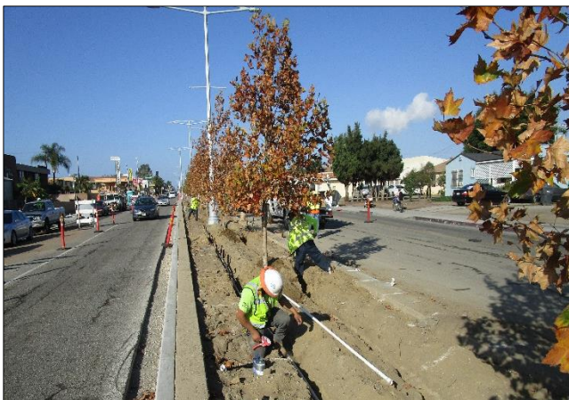
Installing Irrigation Laterals, Risers and Heads in Median