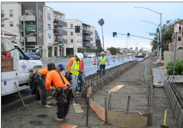
Forming Curb and Gutter North Side of Carson