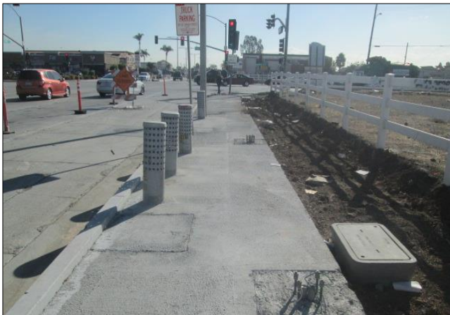
Looking East Area for Pavers West of Figueroa