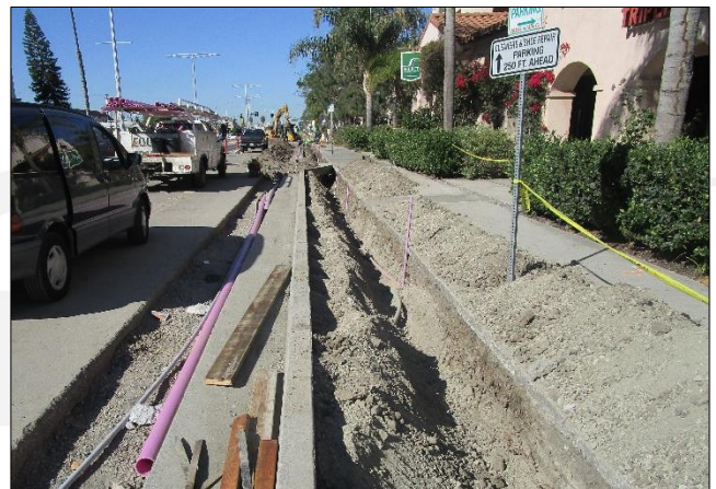
Installing Irrigation Mainline on North Side of Carson