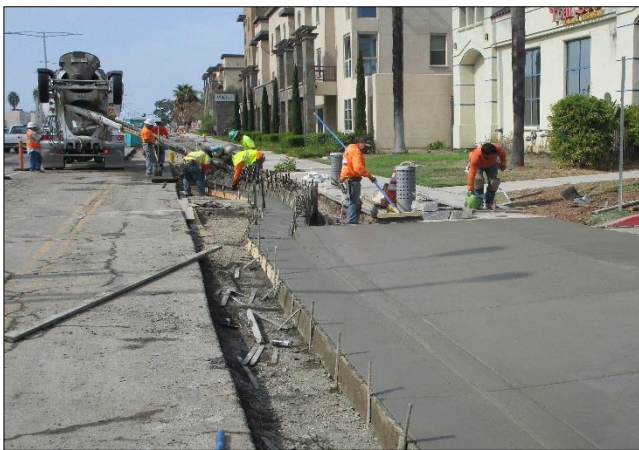
Driveway Placed on North Side of Carson West of Grace