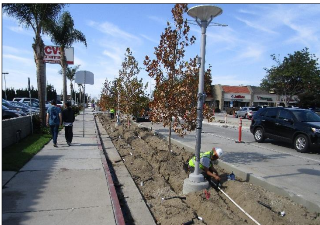
Installing Irrigation Laterals, Risers and Heads in Parkway