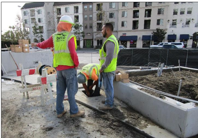
Installing Conductor for City Hall