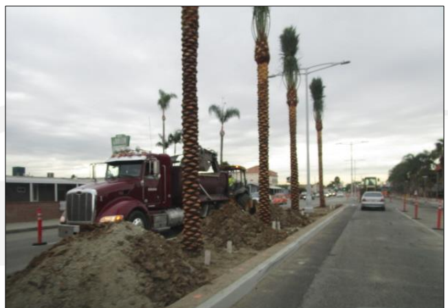
Removing Spoils from Palm Trees