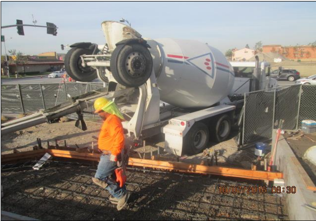
Placing Portland Concrete Cement East Landing at Stairway