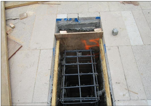
Bus Shelter Foundation