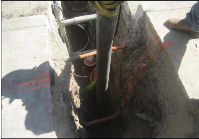
Pouring Thrust Block off Trench Main North of Carson