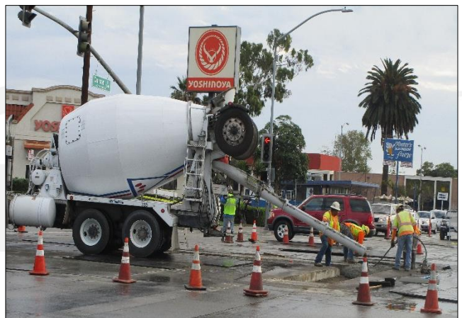
Placing Concrete in Intersection of Carson on Main