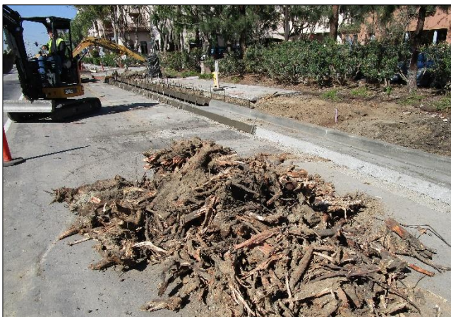
Tree Roots Removed East of Grace