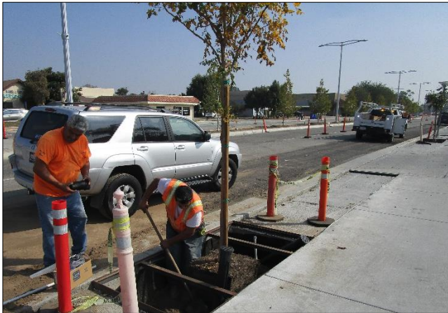
Installing 24" Boxed Parkway Tree