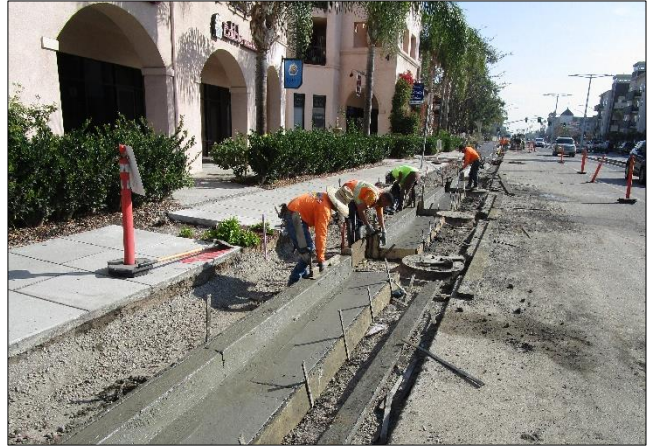
Finishing Curb and Gutter