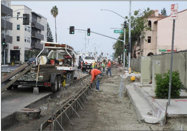
Setting Forms for Curb and Gutter