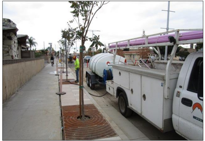
Removing Spoils from Palm Tree Planting