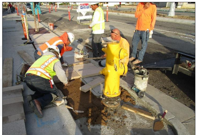
Placing Architectural Pavers