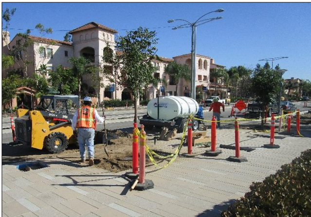
Planting and Watering Trees on Carson