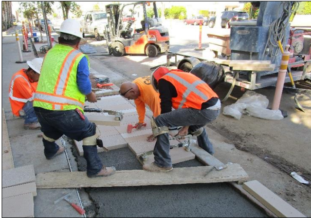
Installing Architectural Pavers South Side of Carson