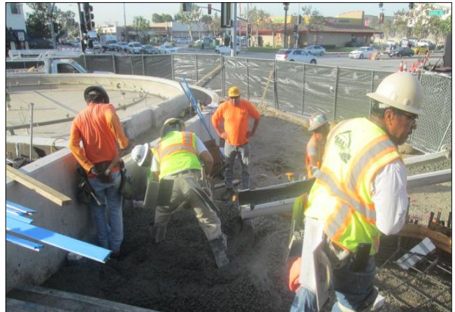
Placing Portland Concrete Cement West Landing at Stairway