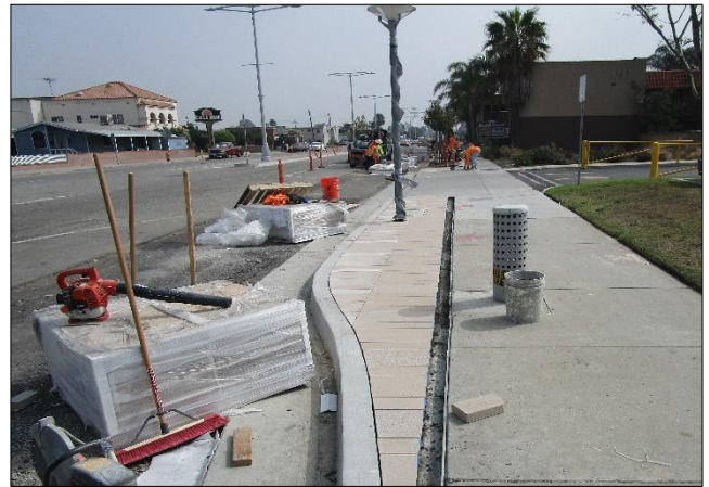
Architectural Pavers Installed South Side, East of Figueroa