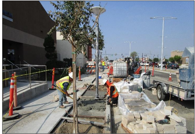
Preparing Bedding for Architectural Pavers