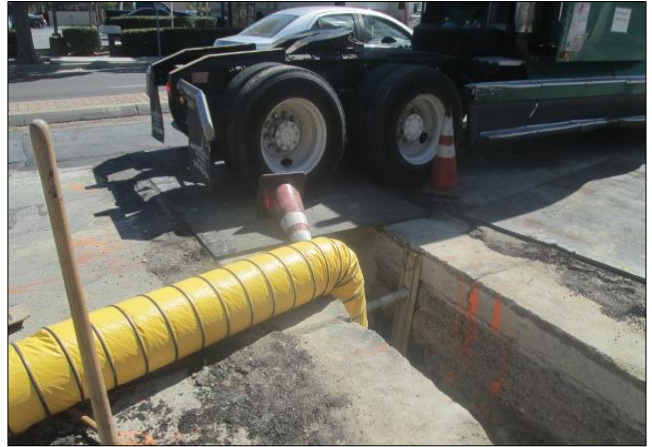
Blower for Petroleum Smell Removal