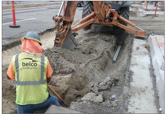
Potholing During Trenching