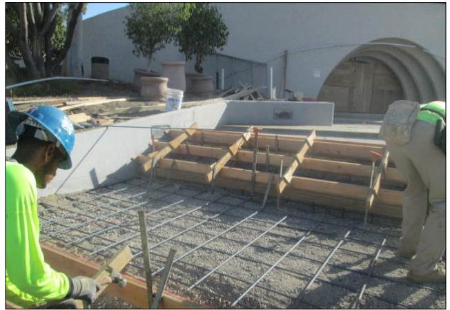
Placing Rebar in West Stairway at City Hall