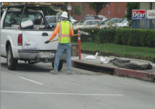
Watering Trees on Carson