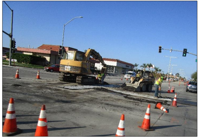
Removing Plates from Carson and Main Intersection