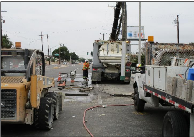
Potholing for Installation of Waterline