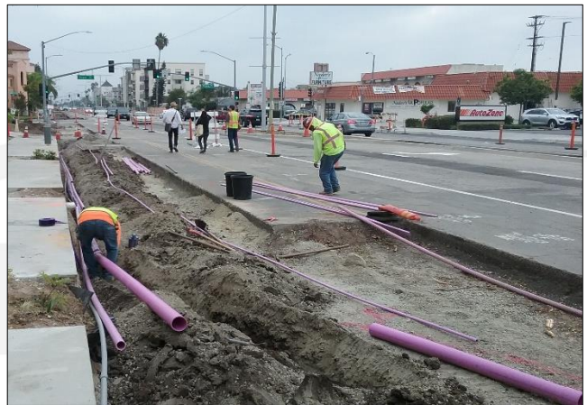
Installing Irrigation System