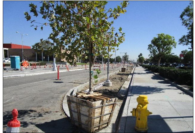
Trees for Planting South Side of Grace