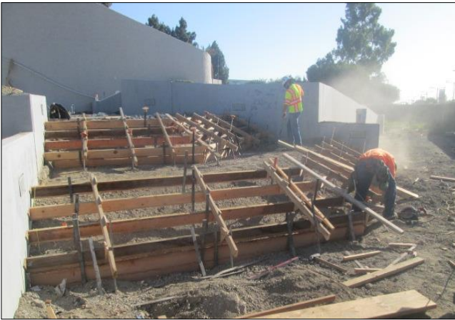
Forming South Stairway at City Hall