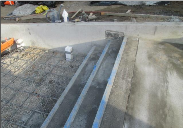
Typical Stairway City Hall