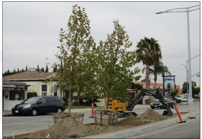
Median Trees Being Installed