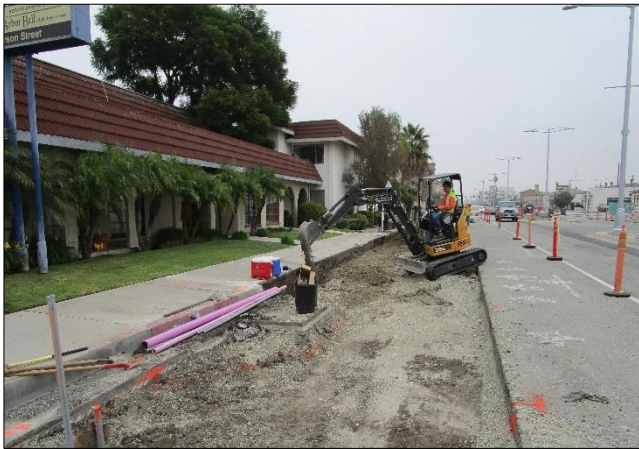
Installing Irrigation Mainline and Laterals