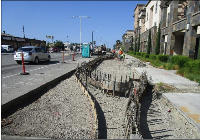
Curb and Gutter Formed on North Side of Carson