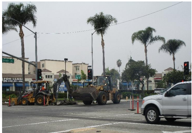
Demolition on Carson Street at Grace