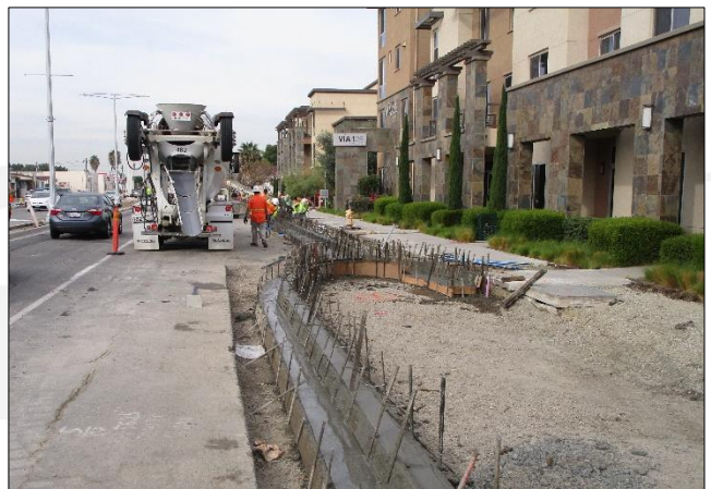
Pulling in New Conductor at Carson and Main