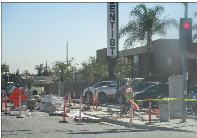
Forming Curb and Gutter on North Side of Carson