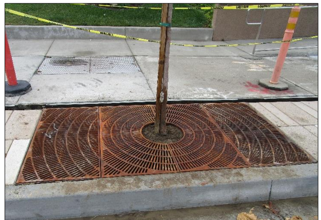
Tree Well Grate Installed South Sided of Carson