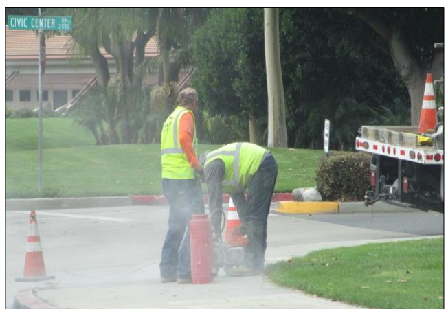
Cleaning Catch Basin Best Management Practices Prior to Rain