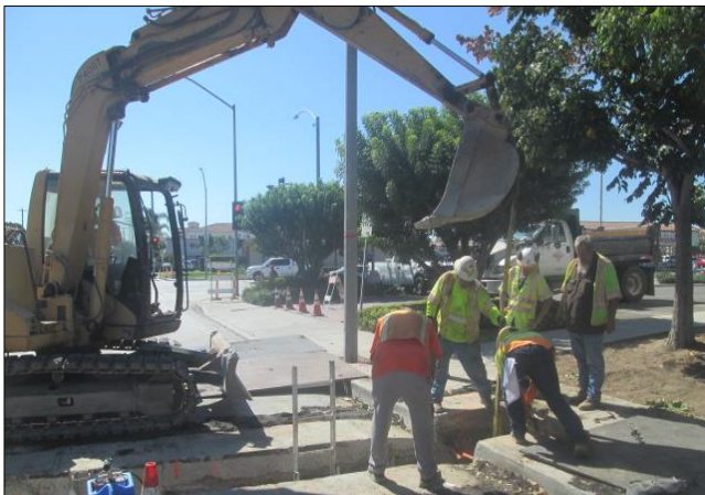
Setting Blow off