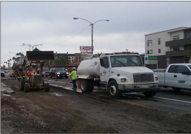
Demolition on North Side of Carson Street