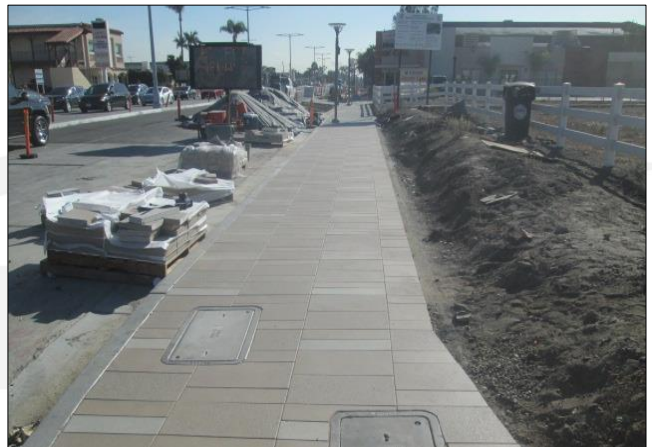
Pavers Complete East of Figueroa