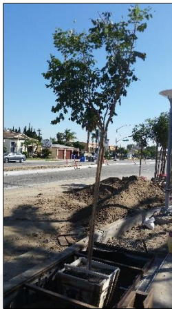
Placing 24" Box Trees