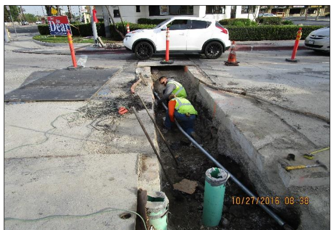
Repairing Traffic Signal Conduit at Carson and Main