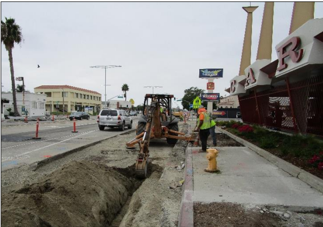
Excavating Trench for Electrical Lighting Conduit