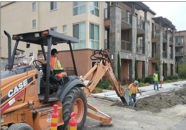
Trenching for Street Lighting Conduit