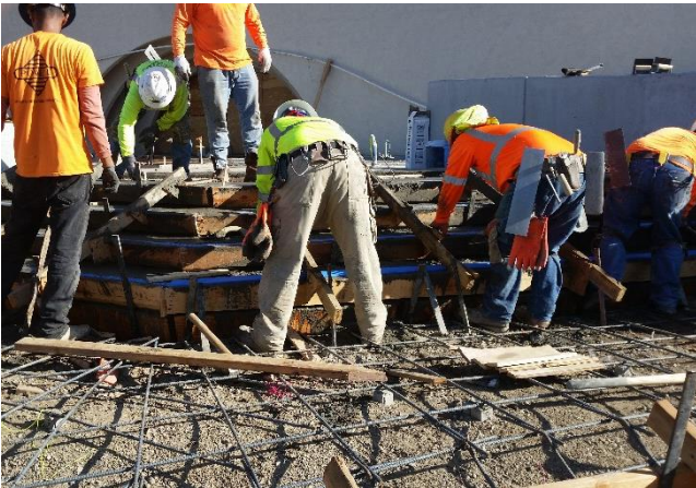
Placing West Stairway City Hall