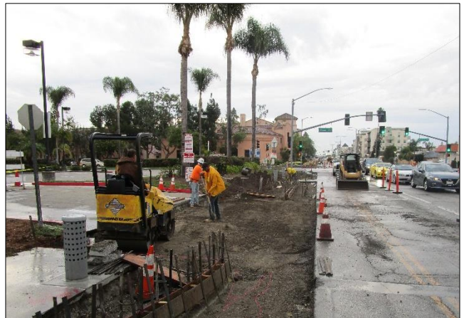
Compacting Crushed Miscellaneous Base for Driveway West Grace